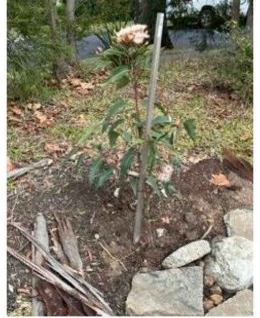
Above: New station facilities open to the public (L) and tree after being replanted to celebrate National Tree Day in July with Killara Public School (R)