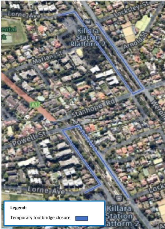
Map of pedestrian detour route during the temporary footbridge closure