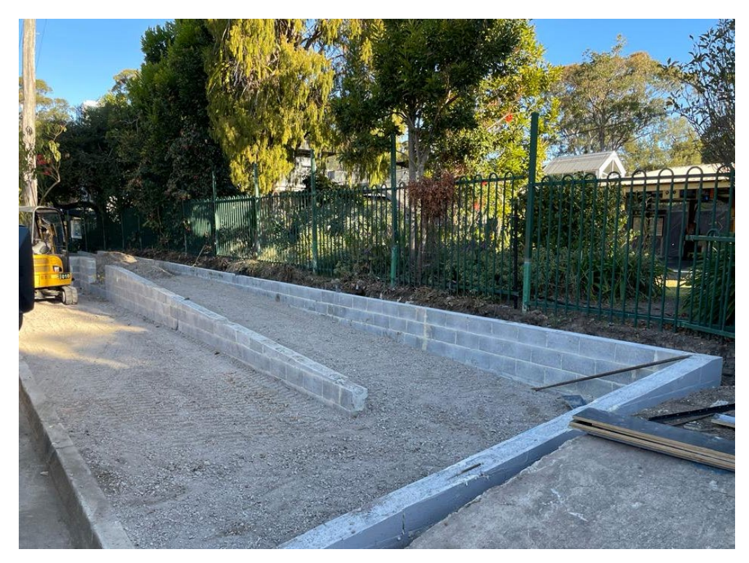
Above: Werona Ave – footpath upgrade