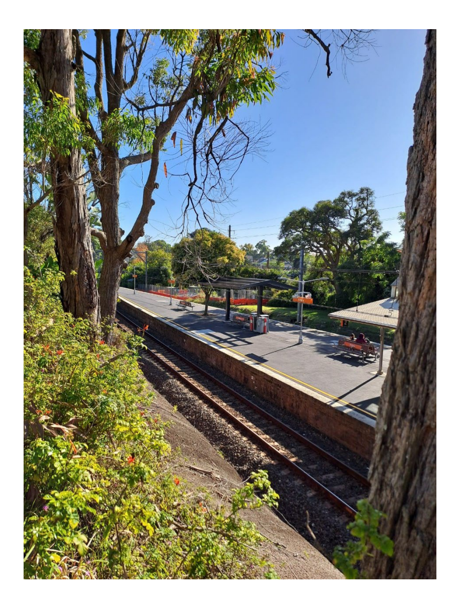
Above: Resurfacing work on the station platform