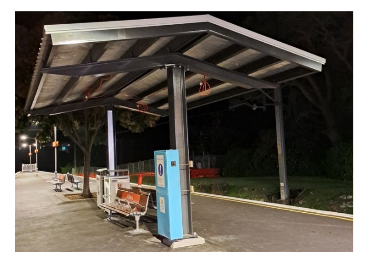
Above: the new canopy for the boarding assistance zone