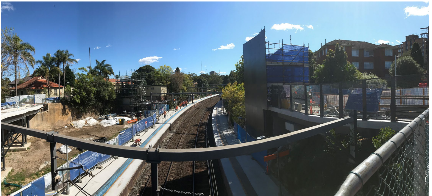
Work being completed at Wollstonecraft Station, September 2021

Transport for NSW is upgrading Wollstonecraft Station as part of the Transport Access Program (TAP) to make it easier for everyone to access, including people with a disability or limited mobility, parents/carers with prams, and customers with luggage.